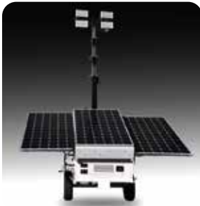
Solar Tower Lights