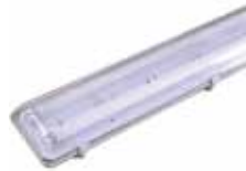
Tubes & Weatherproof Lights