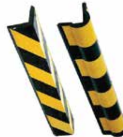
Rubber Corner Guards