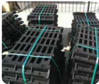
Manhole & Gratings