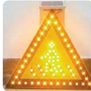
LED Safety Signs