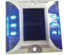
Solar Road Studs