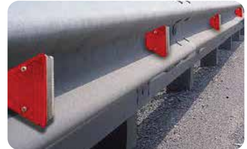
Guard Rails & Reflectors