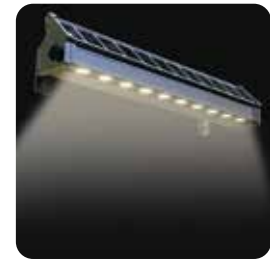
Solar Billboard Lights