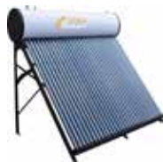
Solar Water Heaters