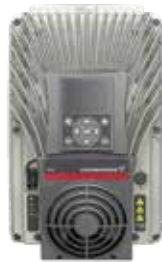
Solar Pump Inverters